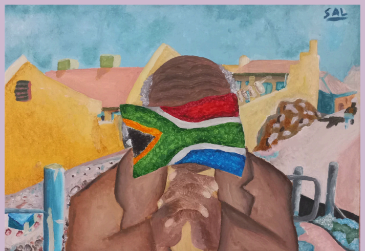
Tribute to Gerard Sekoto, 2024 A3, Acrylic on Canvas