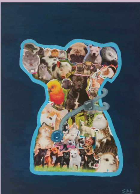
The true heros, 2024 A2, Collage and acrylic on canvas