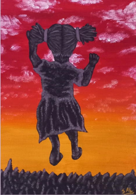
The hopeful child, 2024 A2 Acrylic on canvas